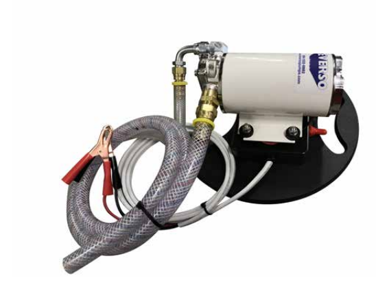
Portable System sits on lid of a 5-Gallon Bucket