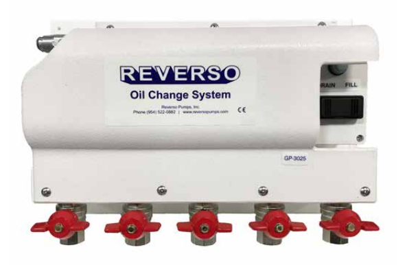
5-Valve Manifold System

Portable systems offer the same efficient maintenance in a convenient, easy-to-operate unit. Multiple generators/engines can be serviced by one pump, and it is an alternative option to an installed pump when space is limited. The system eliminates slow and potentially messy hand pump operations and operates on 12 or 24 volt power (battery clips included).