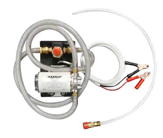
Portable System for Outboard Engines