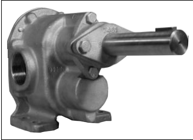
MODEL N13500-21- UPPER DRIVE MODEL N13510-21 - LOWER DRIVE