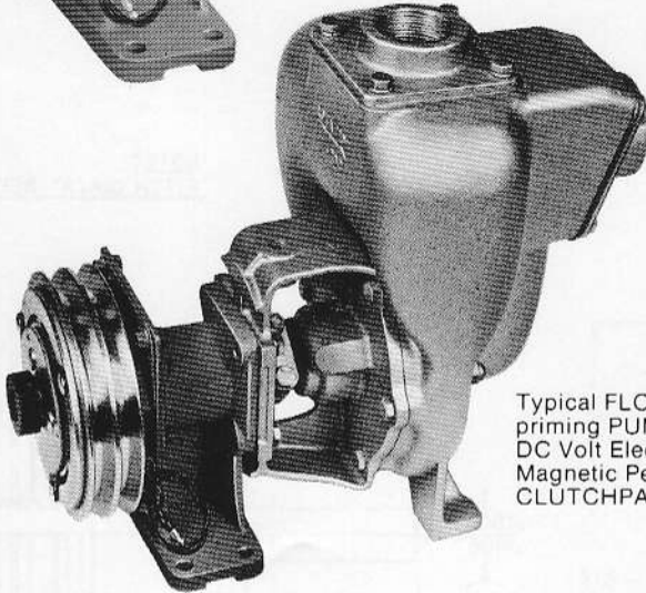
Typical FLOMAX self-priming PUMP with DC Volt Electro Magnetic Pedestal CLUTCHPAK.

Model No. 27049 - 12 Volt DC Electro Magnetic CLUTCHPAK