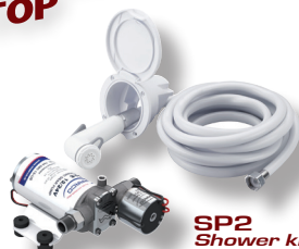
SP2 Shower kit Part Number 164 900 15