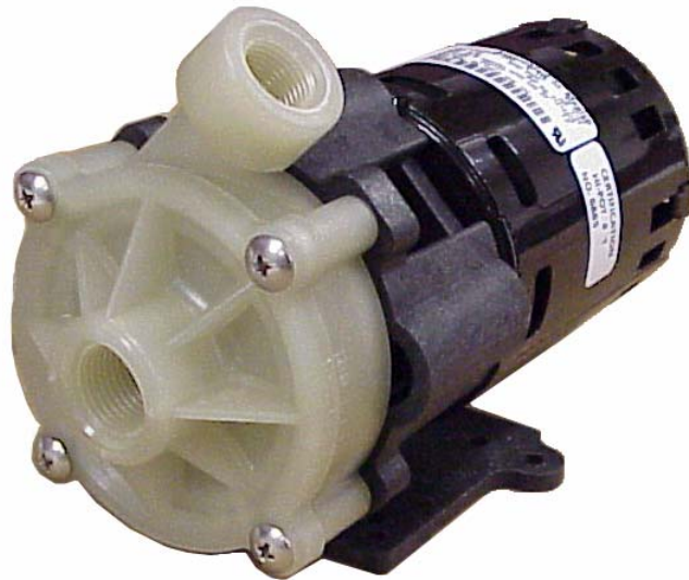
MODELS MDXT MDXT-3