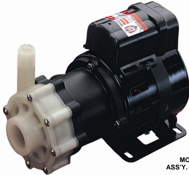
MODEL AC-5C-MD ASS'Y. NO. 0150-0026-0100