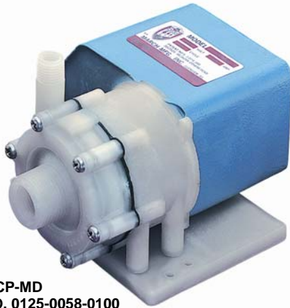
MODEL 2CP-MD ASS'Y. NO. 0125-0058-0100