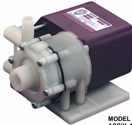
MODEL LC-2CP-MD ASS'Y. NO. 0125-0057-0200