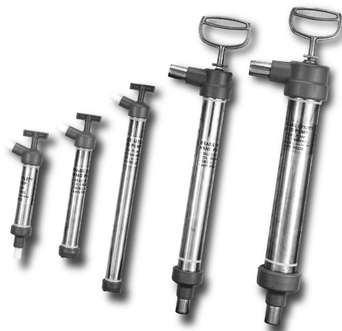
Utility Hand Pumps

To disassemble pump for cleaning and repair, pull handle out approximately 4" and place screwdriver carefully under bottom of spout cap and over outside of cylinder roll. Lift up on screwdriver and pry off spout cap. Pull out plunger shaft assembly. Lift full floating plunger off seat and clean between cup and seat. Remove intake cap in same way as spout cap. Take disc valve from cylinder and clean under neoprene flapper. Run rag through