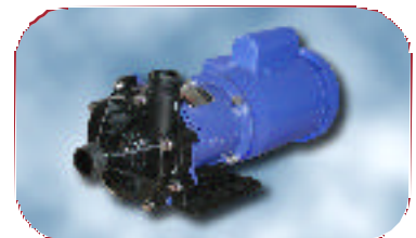
Dry run capable pumps, for PLATING and INDUSTRIAL PROCESS