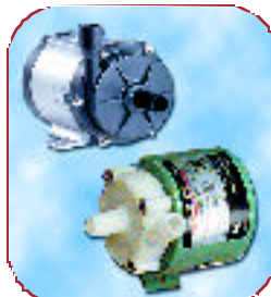
Compact re-circulating pumps, for COOLING LOOPS, PLATING and other applications