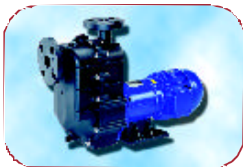
Self-priming, dry run capable pumps, for general INDUSTRY and PLATING