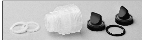
3/4", 1", 1 1/2" and 2" Bellows Kit

(Valve extension required only on suction port.)