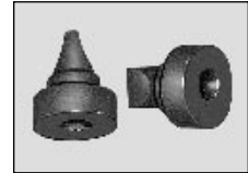
1/2" Bellows Kit

Duckbill valves are required in those applications where heavy slurries or fibrous materials are being pumped. Heavy slurries should be flushed from the bellows before the pump is shut down. The standard elastomers are EPT/EPDM, Hypalon, and Viton®/Fluoroelastomer. However, Butyl, Hydrin, Kel-F®, Silicone and Nitrile can be supplied.