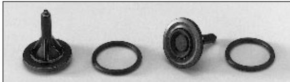
3/4", 1", 1 1/2" and 2" Poppet Kit