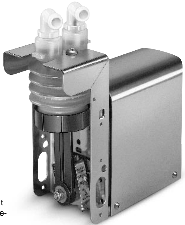
2 1/2" STANDARD MODEL