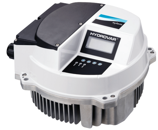
Pump Mounted Variable Speed Controller

HYDROVAR is the intelligent pump controller that matches the performance to system demand. The HYDROVAR is easily mounted directly on the motor of the pump and will fit on any standard TEFC NEMA motor. This makes the HYDROVAR an excellent choice for retrofitting and upgrading of fixed speed systems. There's no need for an external control panel when using HYDROVAR.