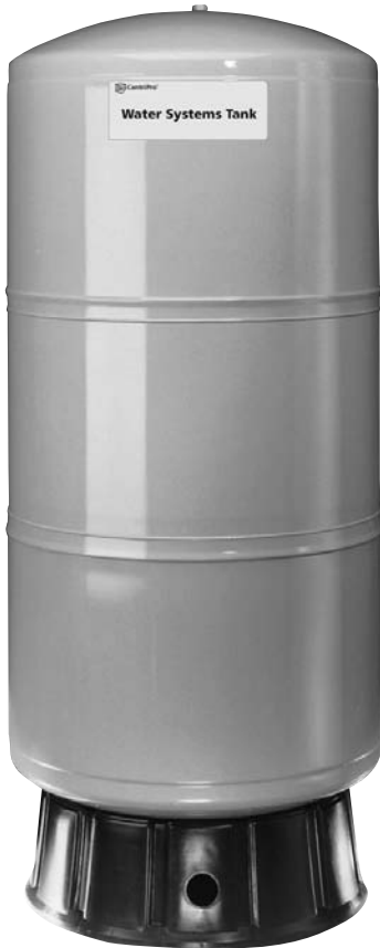
Stand Model (Vertical)