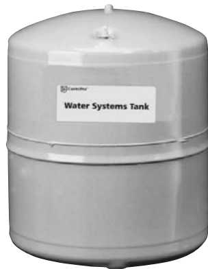
In-Line Pipe Mounted Model