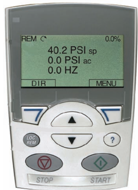
Easy to navigate keypad with QUICKSTART feature and pump specific language!