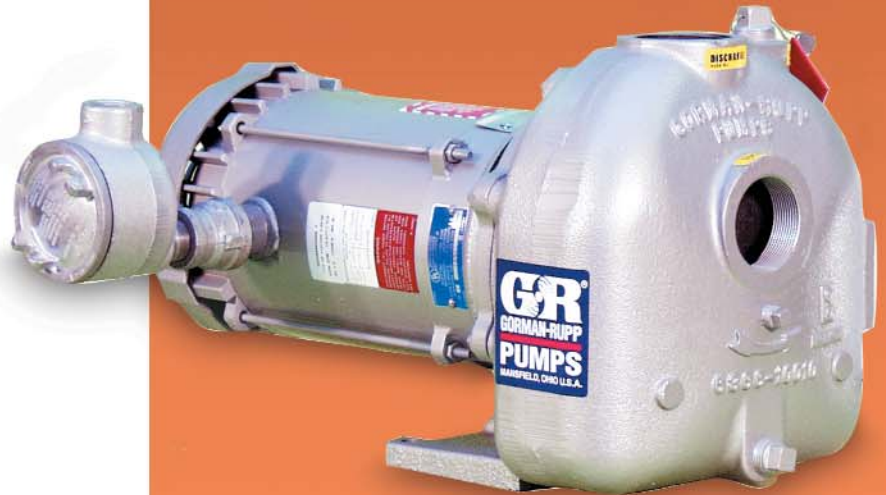
Model 02C3-X1.5 1P