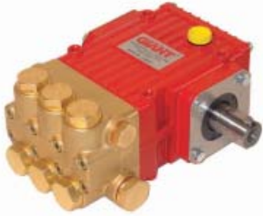
P223 3 GPM @ 3000 PSI