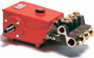
MP SERIES UP TO 18 GPM UP TO 3600 PSI