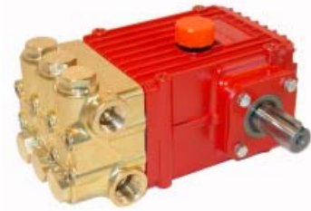
P422 10 GPM @ 3000 PSI