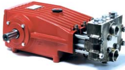
LP SERIES UP TO 40 GPM UP TO 7250 PSI