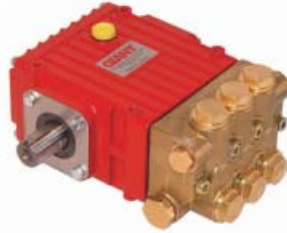
P316 5 GPM @ 3000 PSI