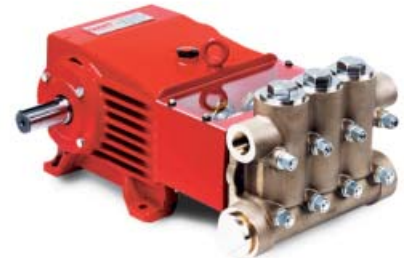
GP SERIES UP TO 105 GPM UP TO 10,000 PSI