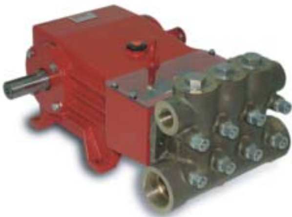
GP6145-3100 46.2 GPM @ 1740 PSI @ 800 RPM - 55.8 BHP