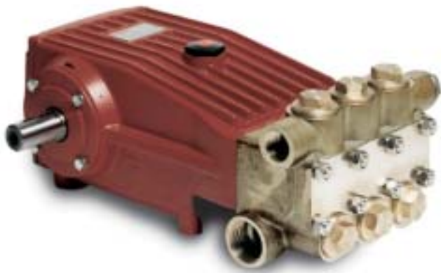
LP122A-3100 35.0 GPM @ 1300 PSI @ 800 RPM - 31.6 BHP