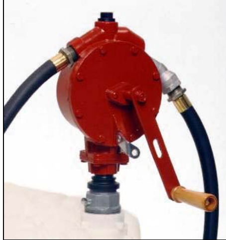
Model 100 Rotary Hand Pump Shown FILL-RITE