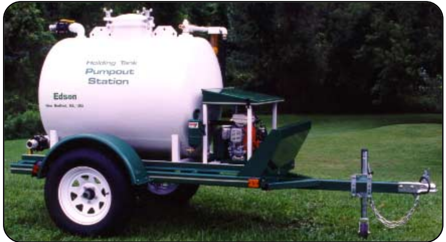
290-235-03 Shown With Optional Gas Engine

An optional pump out hose assemblies come complete with all fittings and adapters necessary to pump out any boat.