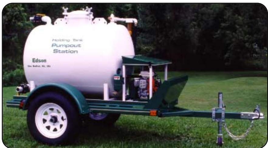
290-235-03 Shown With Optional Gas Engine

An optional pump out hose assemblies come complete with all fittings and adapters necessary to pump out any boat.