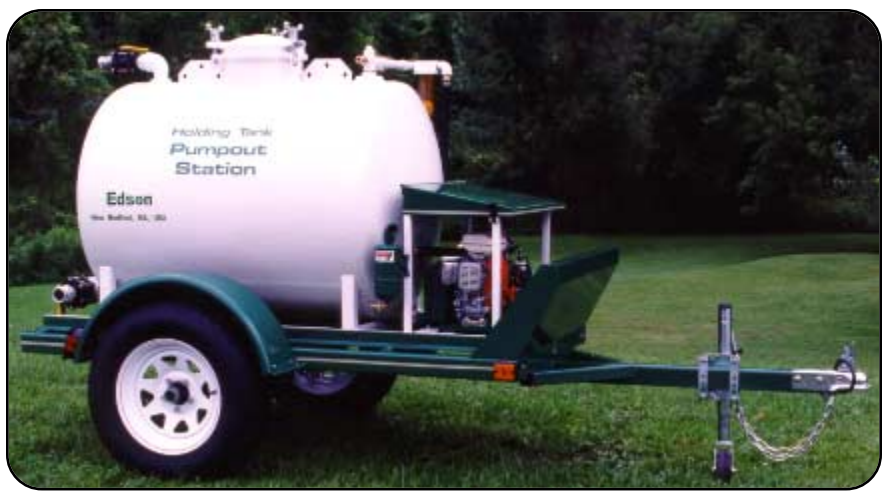
290-235-03 Shown With Optional Gas Engine

An optional pump out hose assemblies come complete with all fittings and adapters necessary to pump out any boat.