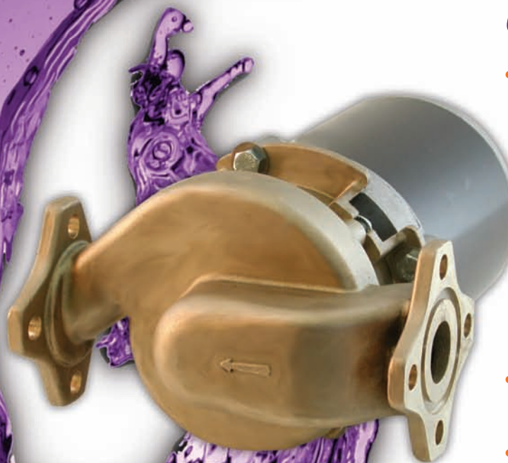
Bronze Circulator Pump

AMT Inline Circulator Pumps are designed for continuous duty industrial/ commercial systems. Pumps are available in a variety of material configurations to meet your specifications. All models are powered by a single phase 115 VAC ODP 56J NEMA frame 1/4 HP electric motor with 1/2-14 NPSM conduit connection. Direct coupled design eliminates stub shaft, oiled bearing and coupling, reducing maintenance. Pumps are interchangeable with other manufacturers, see cross reference on specification page.