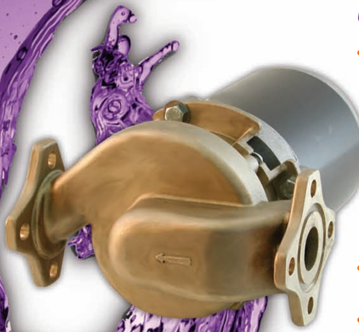
Bronze Circulator Pump

AMT Inline Circulator Pumps are designed for continuous duty industrial/ commercial systems. Pumps are available in a variety of material configurations to meet your specifications. All models are powered by a single phase 115 VAC ODP 56J NEMA frame 1/4 HP electric motor with 1/2-14 NPSM conduit connection. Direct coupled design eliminates stub shaft, oiled bearing and coupling, reducing maintenance. Pumps are interchangeable with other manufacturers, see cross reference on specification page.