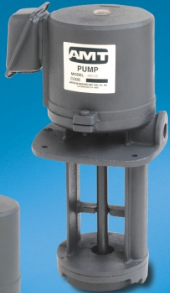
Suction Type Pump