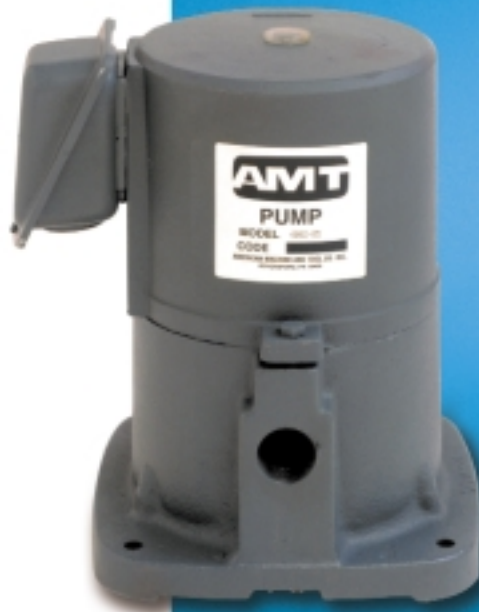
Immersion Type Pump

AMT Interchangeable Coolant/Oil pumps are reliable, cost effective and low maintenance. For use with non-flammable liquids compatible with pump component materials.