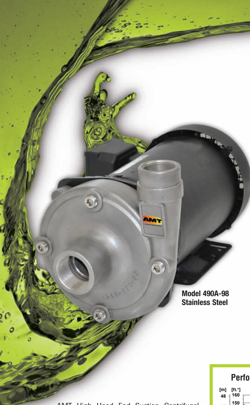
Model 490A-98 Stainless Steel

AMT High Head End Suction Centrifugal pumps are designed for continuous-duty OEM, Industrial/Commercial and processing applications including circulation, chemical processing, liquid transfer, heating and cooling, sprinkler/fire protection systems and pressure boosting.