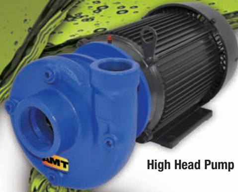
High Head Pump