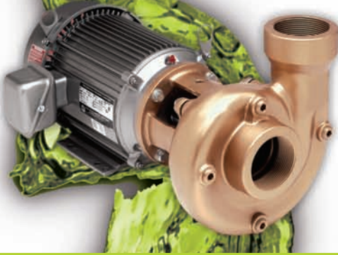
High Flow Pump