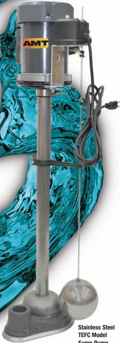
Stainless Steel TEFC Model Sump Pump