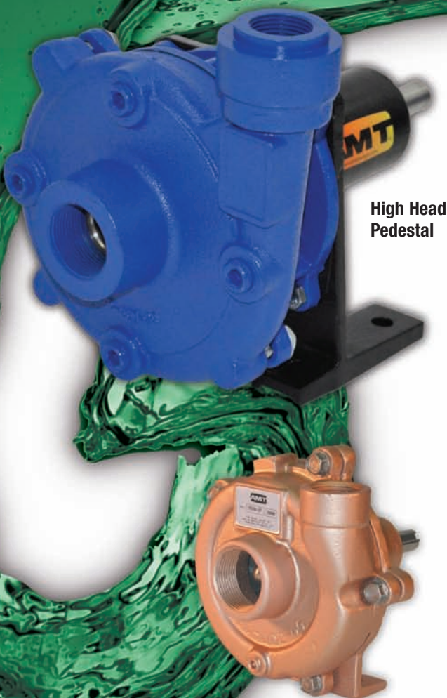
High Head Pedestal