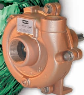
Bronze Straight Pedestal