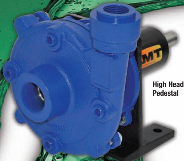
High Head Pedestal