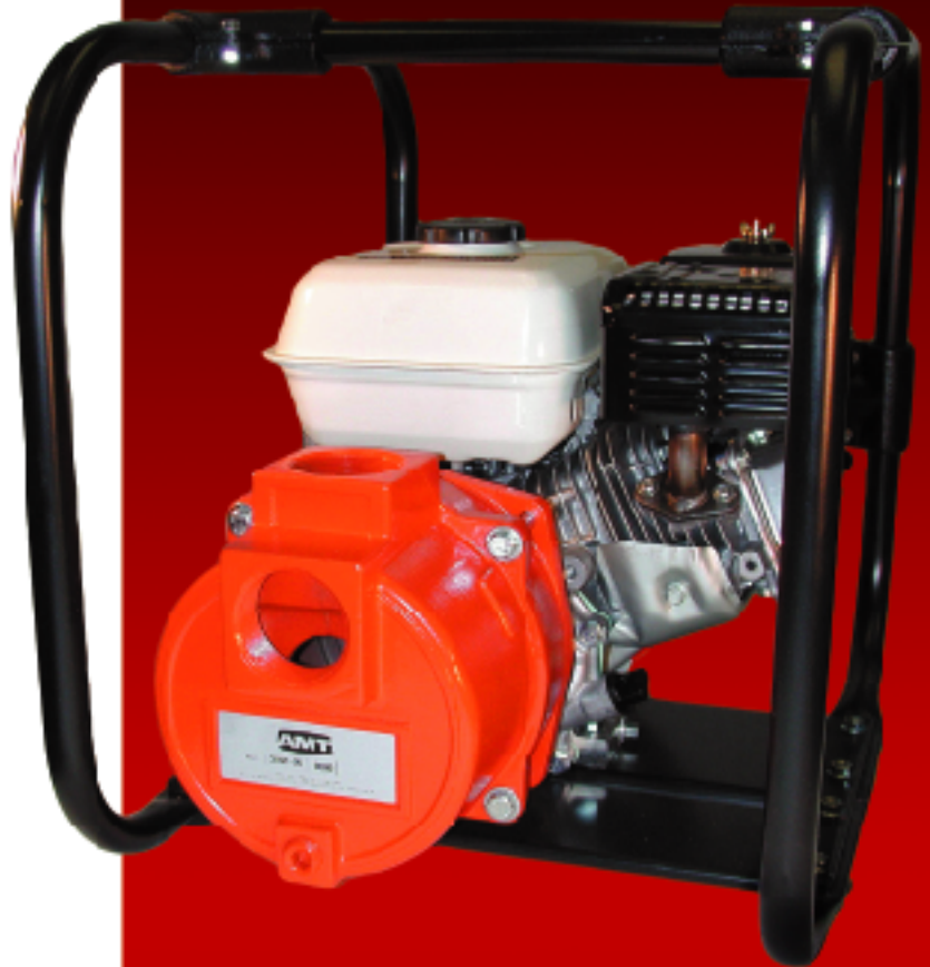
316F-95 Dredging Pump

AMT Dredging pumps are reliable, cost effective and low maintenance. For use with nonflammable liquids compatible with pump component materials.