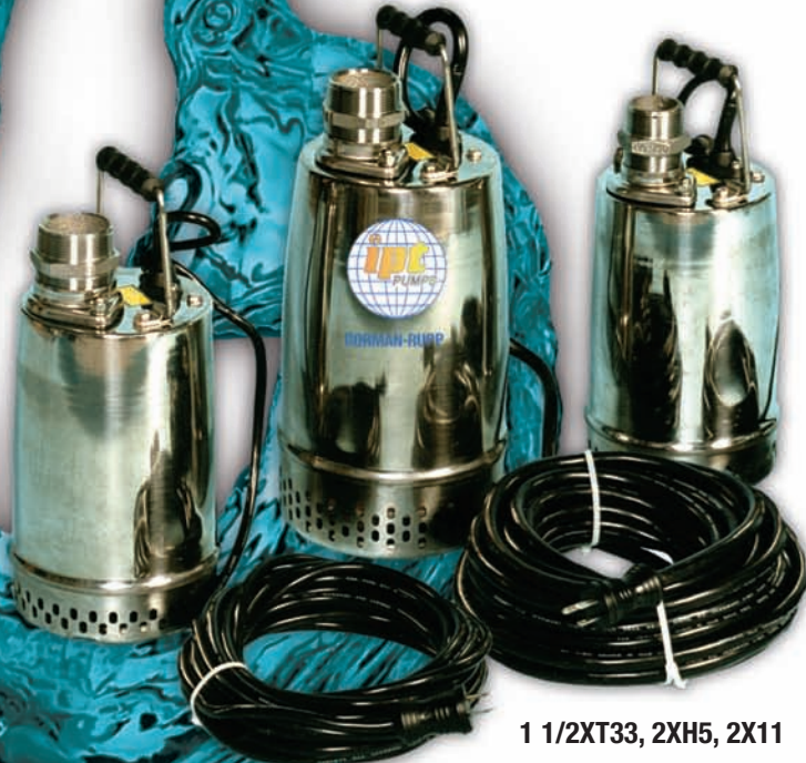
1 1/2XT33, 2XH5, 2X11