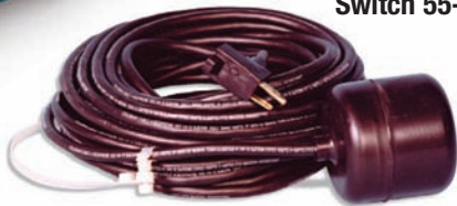
Optional Piggyback Float Switch 55-930

Slim-design, light weight CSA listed submersibles feature top discharge as well as cast-iron impellers, 304 stainless steel casing, motor housing, shaft and hardware. Pump motor is thermal overload protected. An optional piggyback mercury-free float switch is available. Float Switches: The mercury free liquid level control has a piggyback plug molded to the cord allowing the pump motor to plug into the cord and then plug the entire assembly into a standard grounded outlet.