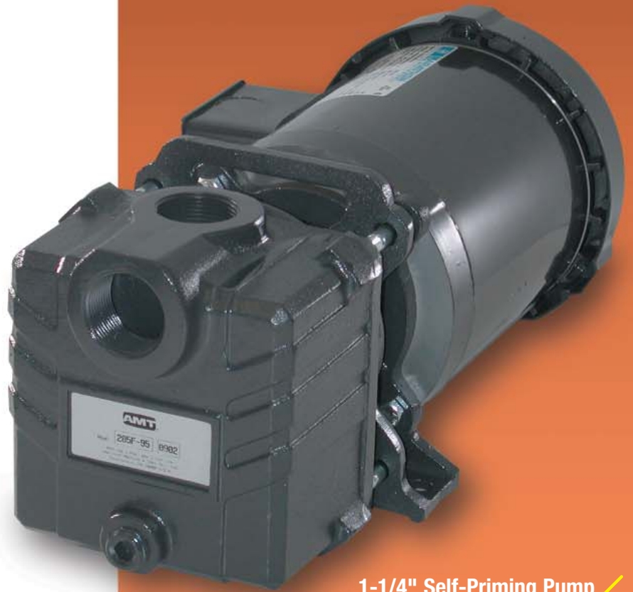
1-1/4" Self-Priming Pump