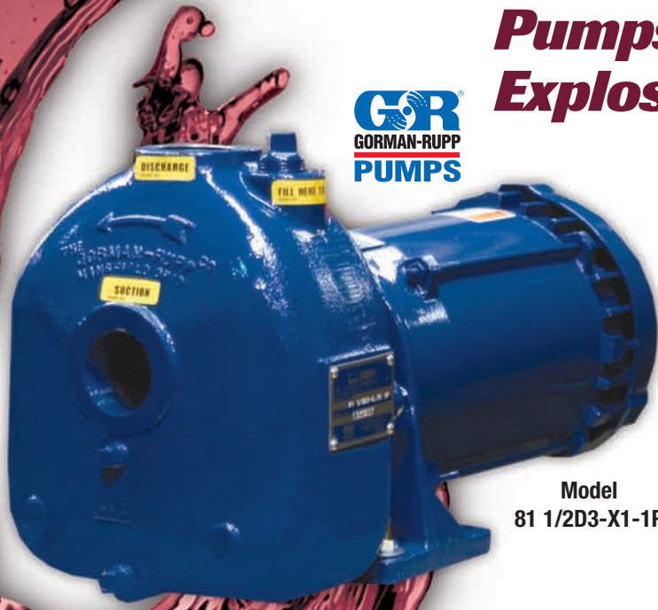
Model 81 1/2D3-X1-1P