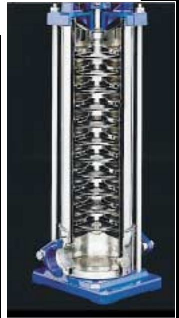
SERIES B OR D