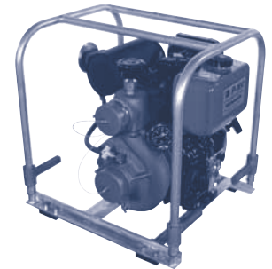
"Navy Spec" Diesel Fire Pump