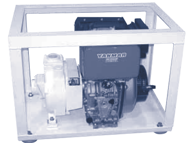
10 HP Yanmar Diesel