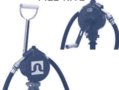
Piston, Rotary Hand Operated