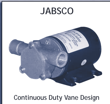
Continuous Duty Vane Design