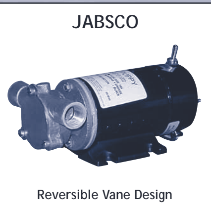
Reversible Vane Design