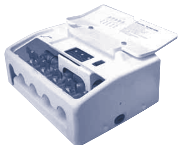
Gear Pump Design