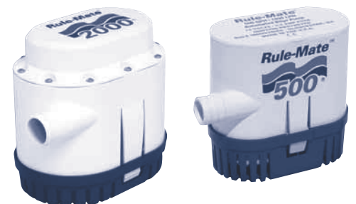
Rule-Mate Automatic Series