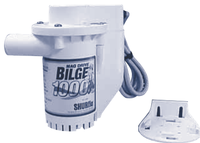
Magnetic Drive Series