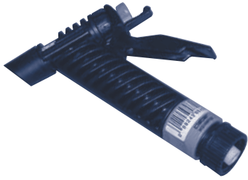
Swivel, Quick Release, Check Valve