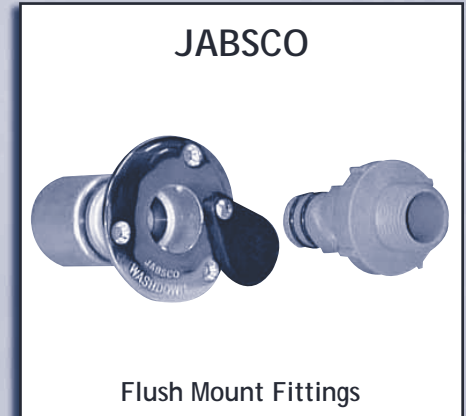
Flush Mount Fittings