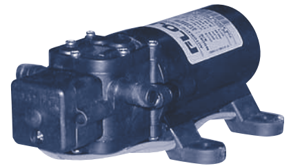
"Mini" Water Systems