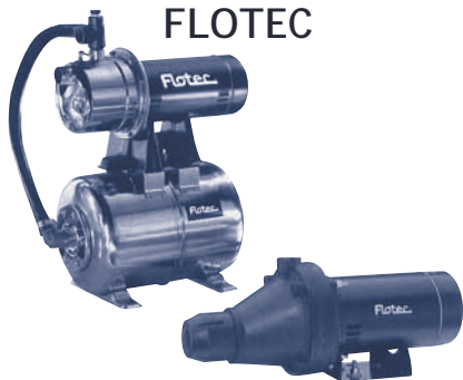
Stainless / Thermoplastic