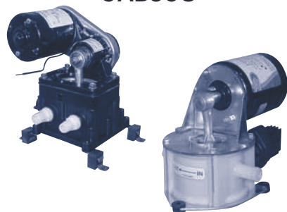
36950 / 37215