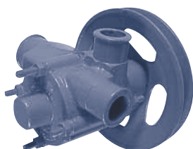
M10270G / M10280G