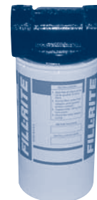
Particulate or Water Removal