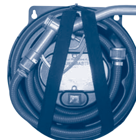
12 vdc and 24 vdc