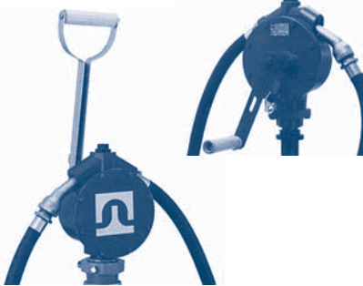
Piston, Rotary Hand Operated