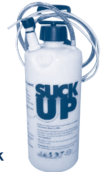
Vacuum Suction Tank