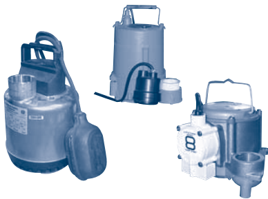
Bronze and Stainless