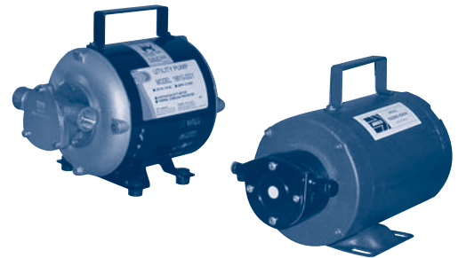
Bronze (3/4") and Plastic (5/8") Series