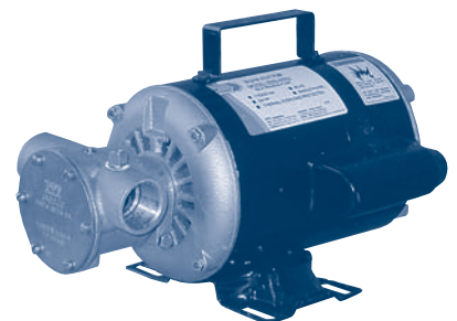
6050 (1") Series