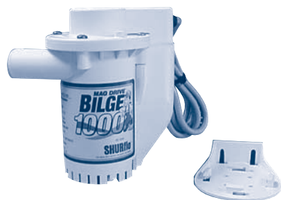
Magnetic Drive Series