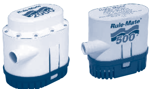
Compact Automatic Series